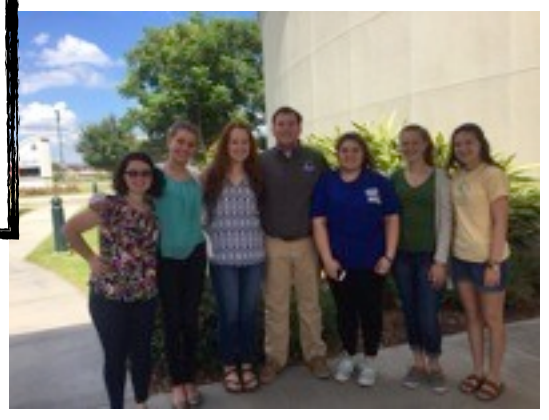
Officers at orientation meeting in Sept.