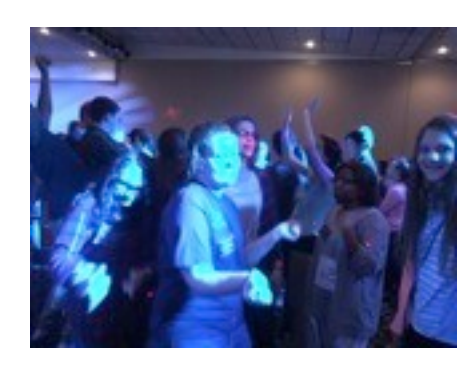
Getting our groove on at the dance contest!