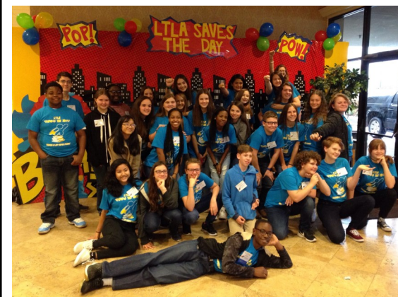
Edgar Martin Middle School @ LTLA 2018!