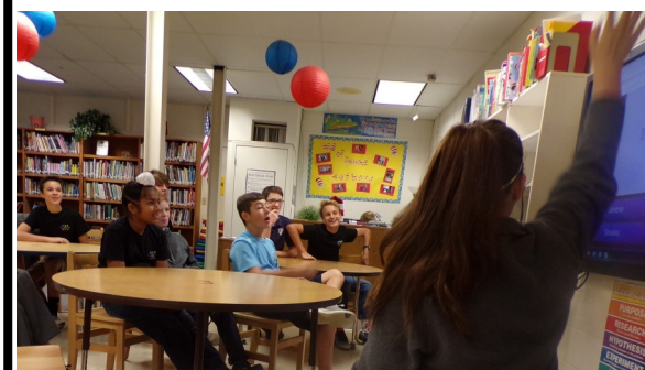
Bishop Noland Episcopal Day School LTLA members host a trivia game program to celebrate TEEN READ WEEK!

Both students and sponsors gain personally and professionally from exchanging ideas, developing new friendships, and participating in various opportunities that are long remembered from their association with LTLA.